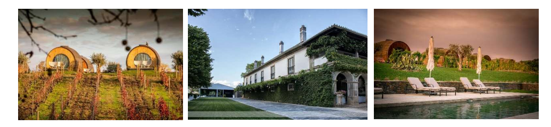
Porto Convention & Visitors Bureau www.portocvb.com

One of the best-known estates in the Douro region, was also one of the first properties to bottle wine under its own label. Inside of the property, you can find a small and deluxe charm hotel with 15 rooms. Located in the heart of Quinta da Pacheca, the Tasting Room is the meeting point for all visitors. On a pleasant place, it puts at your disposal company's entire range of wines, as